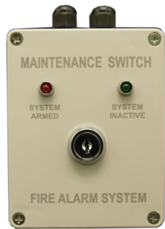
FIGURE 1. Plate

The information is silk-screened on a two-gang stainless plate.